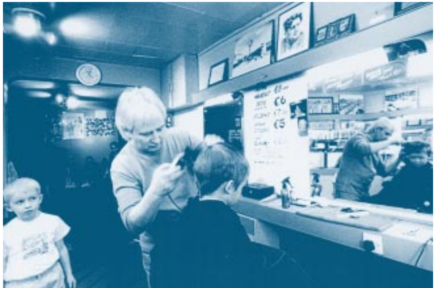
... another mood shot in a traditional barber-shop...