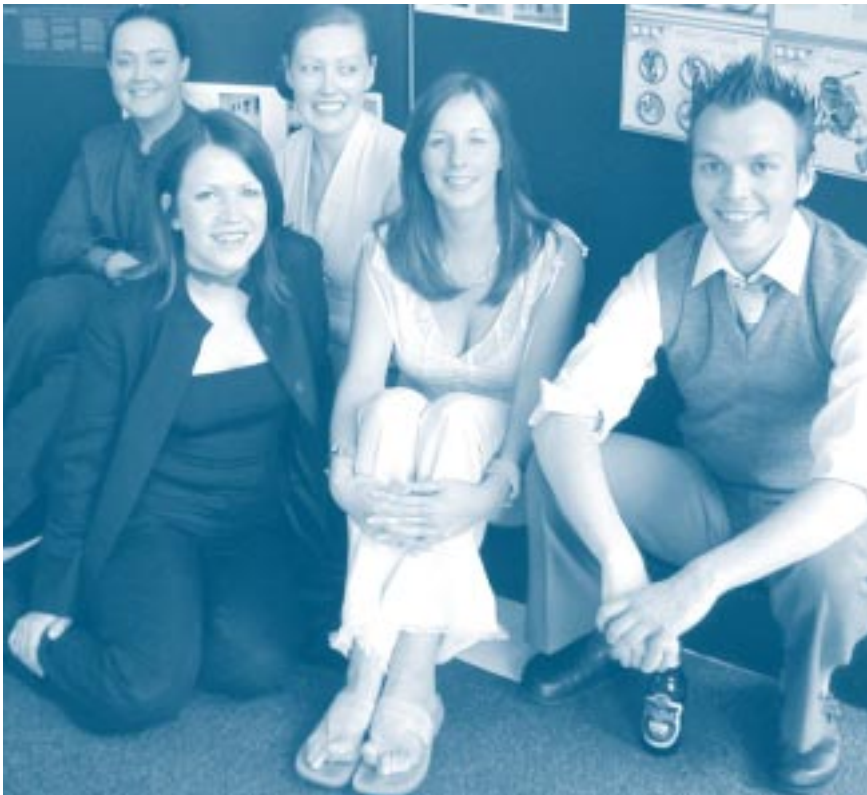
Graduate Designers of the Year pictured at the recent ceremony at RTÉ in Dublin.