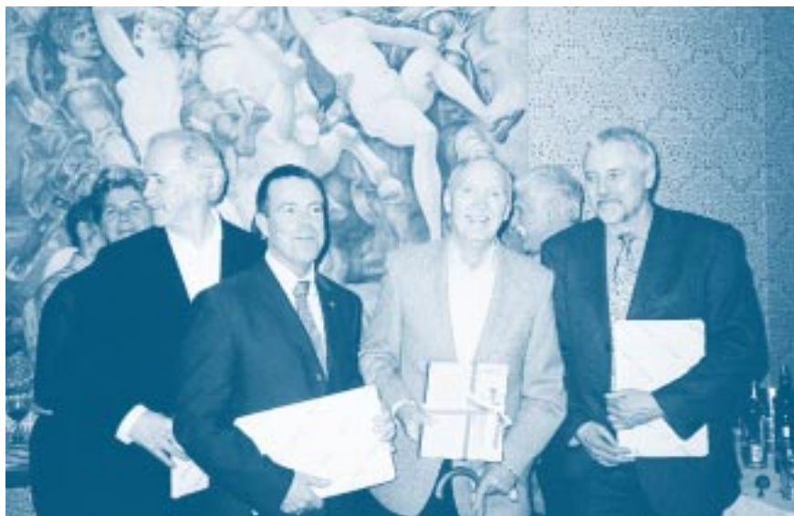
The EIDD 10th anniversary conference took place in the coach house of Dublin Castle in April this year. Speakers appreciated the awards they received.