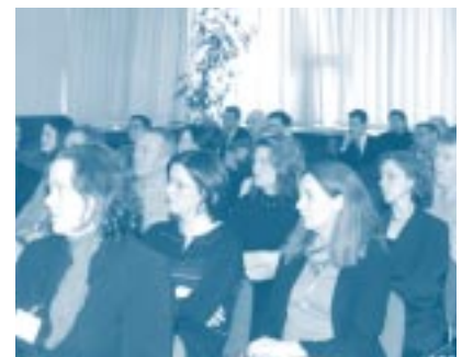
Delegates and speakers at the seminar in Athlone