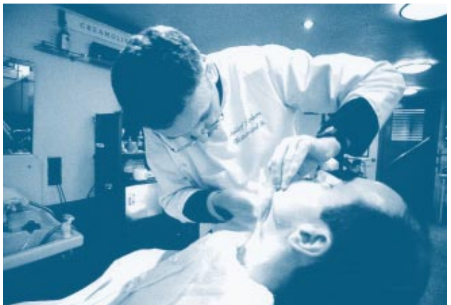
... and the photograph which featured in the AIB calendar.