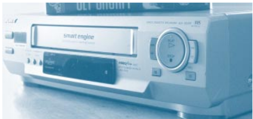
The video recorder: we let our children handle the programming. In other words, we adapt to the deficiencies of the machine and its instruction booklet and, in doing so, let the designers (us) off the hook.

Further information from: Institute for Design and Disability, c/o NCAD, 100 Thomas Street, Dublin 8 or secretary@idd.ie .