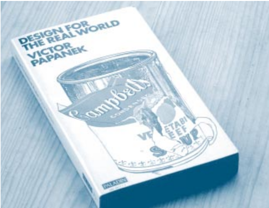
Victor Papanek's classic volume 'Design for the Real World'. His book 'How Things Don't Work' proved less successful, possibly because people don't like books with negative titles, yet explored a question of enormous importance; why is it that the majority of man-made artefacts fail to perform to a satisfactory level?