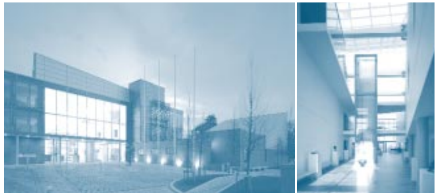
Aras An Chontae, Tullamore, Co. Offaly, designed by ABK Architects for Offaly County Council received both 'Best Sustainable Building' and 'Best Public Building' special awards.