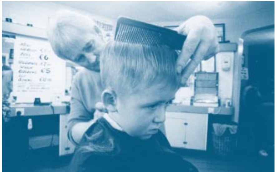
A 'close encounter' and trust in a steady hand...

www.designfortheworld.org/IdeaCubes/form.htm