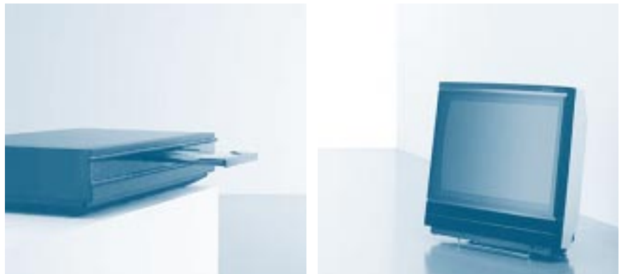
Products from Bang & Olufsen's BeoLink range represent a holistic approach to integrated audio visual solutions for the home or office.